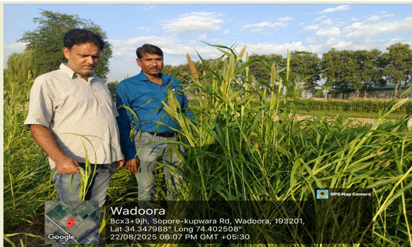
Pearl millet crop at reproductive phase