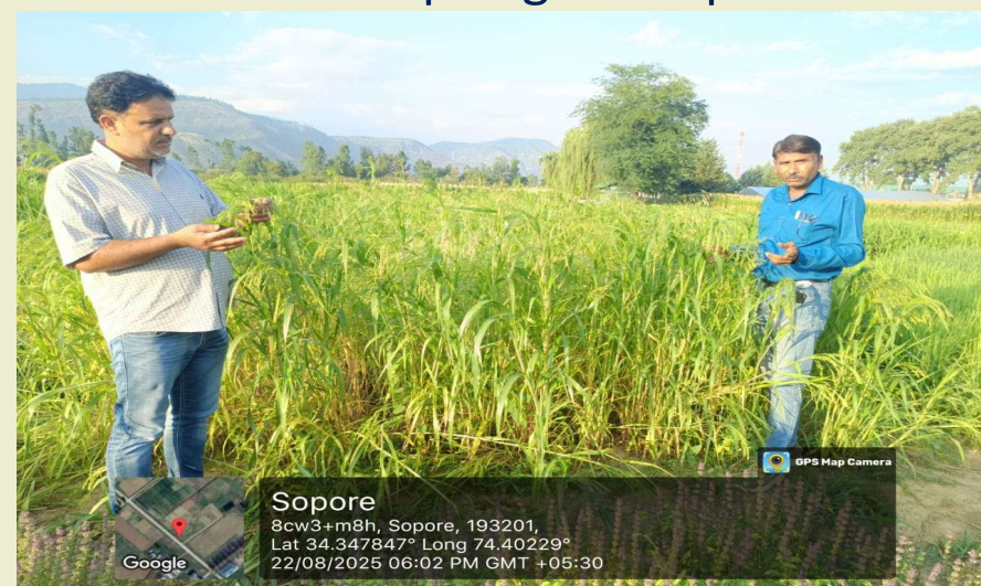
Proso millet crop grain filling stage