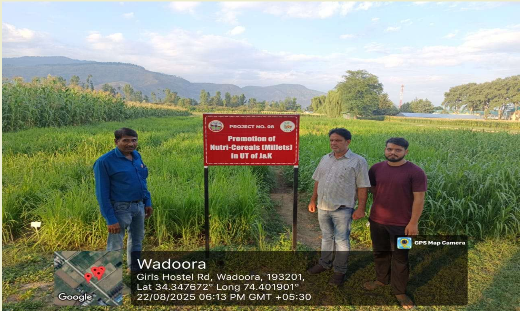
Finger millet and foxtail millet crop at reproductive phase