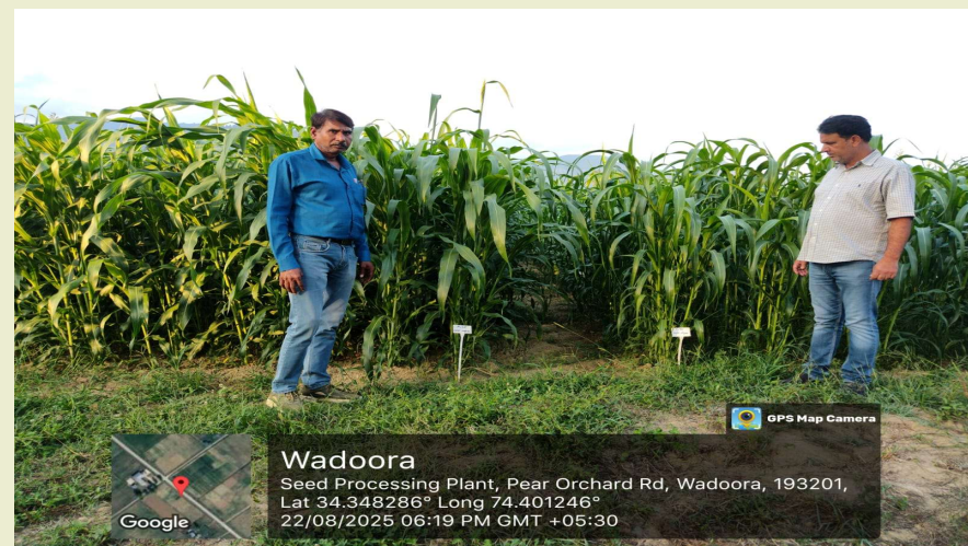
Sorghum millet crop at Booting phase