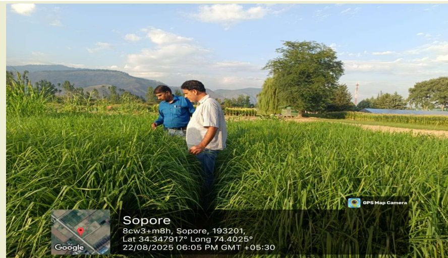
Little millet crop in growth phase