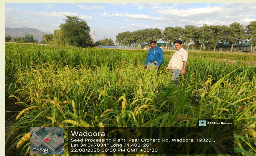
Foxtail millet crop of first date of sowing at dough phase