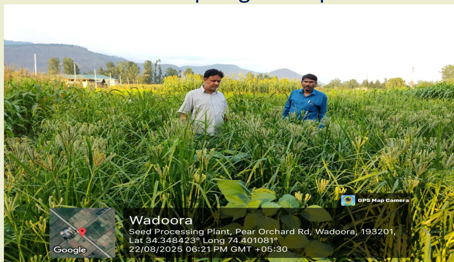
White finger millet crop at flowering stage