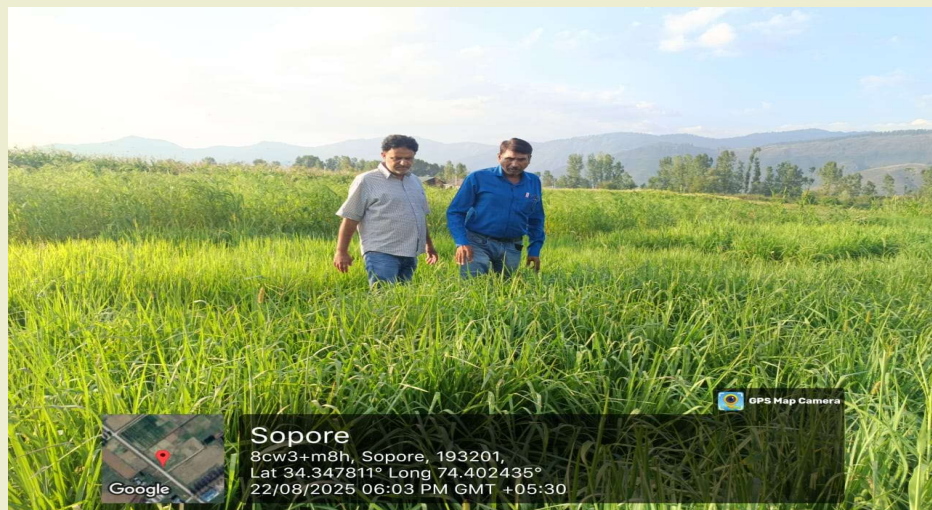
Kodo millet crop in growth phase